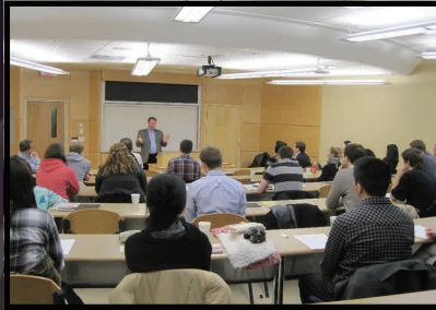
AIMS presents to university students on freedom and responsibility in education

“Over the past fifteen years AIMS has attacked pre-conceptions, assaulted ‘norms’, disproved truisms, and upset conventional wisdom. What we can achieve in the next fifteen is only limited by our imagination and our willingness to commit energy and resources in pursuit of those new possibilities.